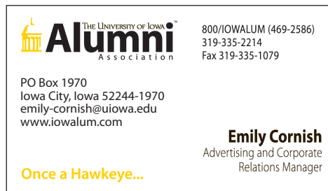
(Sample business card design)