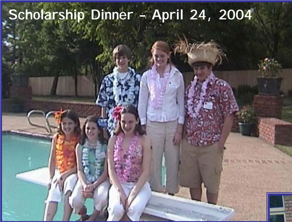
Scholarship Dinner – April 24, 2004