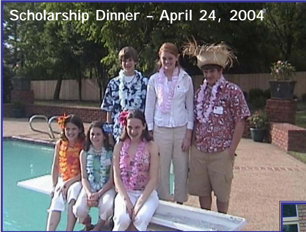
Scholarship Dinner – April 24, 2004