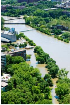
Iowa River Cresting at Record 31 Feet June 18, 2008