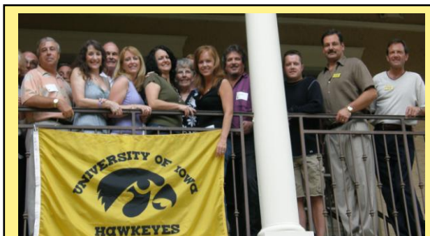
2008 TBIC Board Meeting Attendees

The Tampa Bay Iowa Club held it's annual meeting on July 11, 2008 at the Echelon at the Reserve Clubhouse in St. Petersburg. The meeting is an annual requirement for fulfillment of the TBIC By-laws.