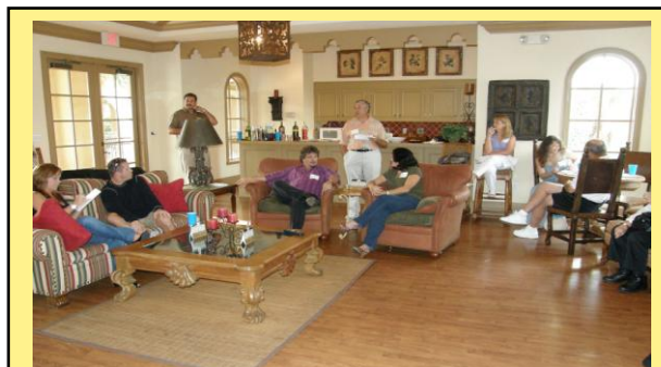
Wine Social at Echelon at the Reserve Clubhouse

To summarize the meeting: All current Board