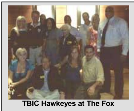
TBIC Hawkeyes at The Fox

On July 17th twenty members of the TBIC met for a Hawkeye Happy Hour at The Fox. Known as the “Cool Jazz Club” the members enjoyed the music, light but gourmet fare, and array of libations.