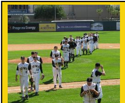
Hawkeyes at Al Lang Stadium After 7-2 Win Over Rutgers

The coaches, players, and family members appreciated the great turnout and support by the Tampa Bay Iowa Club. GO HAWKS!