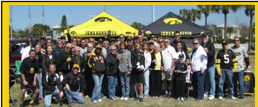
82 Tampa Bay Iowa Club Members and Guests at Sunday's BBQ

Before Sunday's game, the Tampa Bay Iowa Club sponsored a tailgate party with Italian sausages, brats, potato salad, baked beans, chips, cup cakes, and beverages for 82 Iowa fans, including team family members.