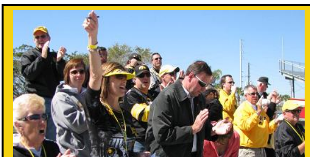
TBIC Fans Cheer on Iowa at Jack Russell Stadium