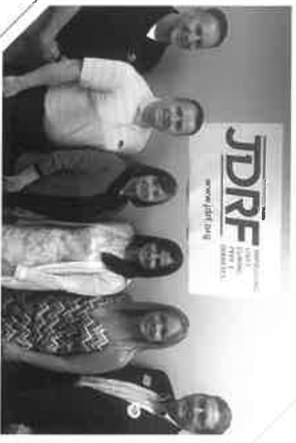
Board members meet with JDRF Directors to deliver proceeds from fund raiser.