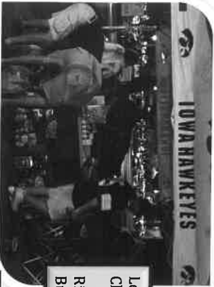
Left: TBIC members loading up food from the Hope Children's Home food drive!