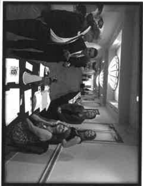
Board members and volunteers prepare for An Evening with Tim Dwight.