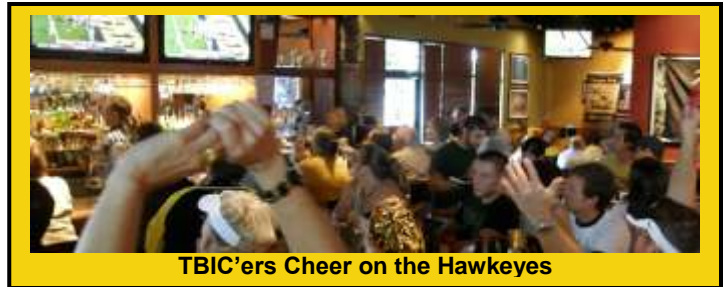
TBIC'ers Cheer on the Hawkeyes

For the past three years the Tampa Bay IOWA Club has conducted a food drive for the Hope Children's Home of Tampa. Each year the TBIC members have increased their donations for this event. At this year's annual food drive event, which was held on October 2 nd , TBIC members generously donated more than 800 food items!