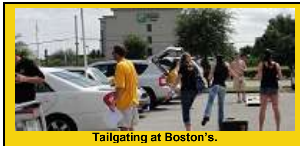
Tailgating at Boston's.