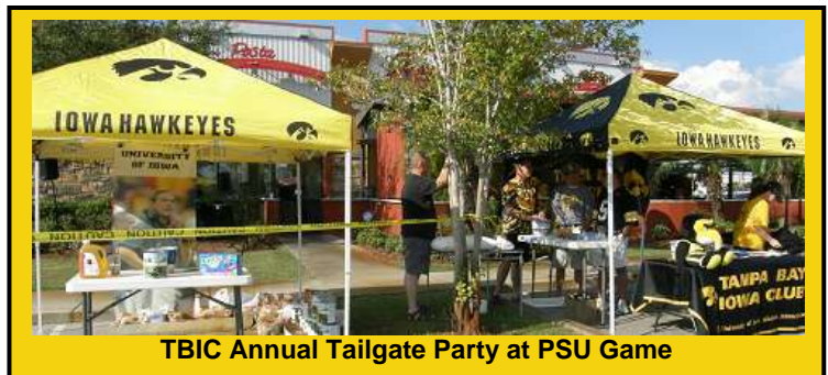
TBIC Annual Tailgate Party at PSU Game

For the past three years the Tampa Bay IOWA Club has conducted a food drive for the Hope Children's Home of Tampa. Each year the TBIC members have increased their donations for this event. At this year's annual food drive event, which was held on October 2 nd , TBIC members generously donated more than 800 food items!