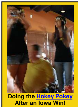
Doing the Hokey Pokey After an Iowa Win!