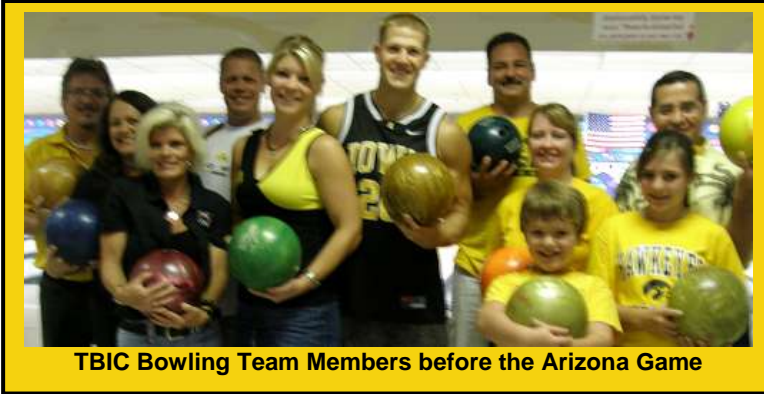
TBIC Bowling Team Members before the Arizona Game

TBIC members have attended 2010 game watches in record crowds. 150 were at the Iowa State game; 57 at a very late Arizona game that kicked off at 10:30pm; etc., for a total attendance this year of 527! Members have had some great fun at the Outdoor Tailgate Party with carnival games at the Penn State Homecoming game, a pre-game bowling event before the Arizona kickoff, tenderloins on the patio at Boston's, and plenty of prizes drawn each time Iowa scores. Join us at Boston's on 10/16!