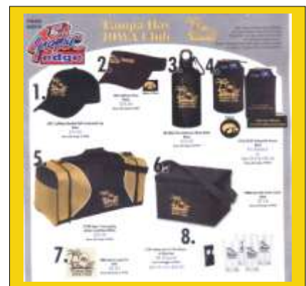
Old favorites and new items