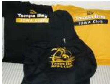
New t-shirt and sweat-shirt designs